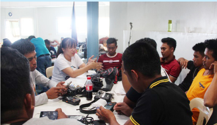
Data Analysts also had a dialogue with their complement Meter Reader Collector / Disconnectors (MRCDs) for a faster and improved teamwork for billing concerns.