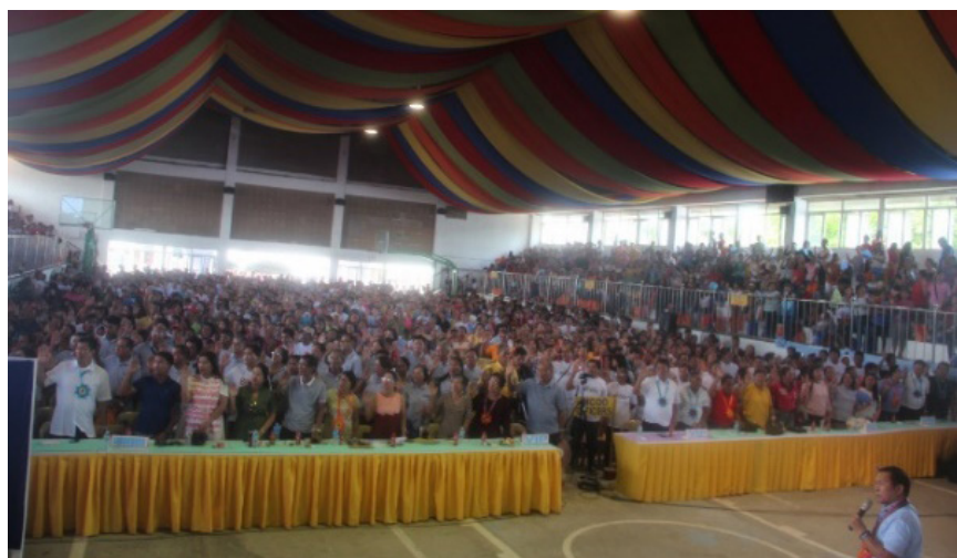
Over seven thousand empowered member-consumer-owners took their oath of membership in the National Center of Electric Cooperative Consumers as catalyst of development for a progressive rural community.

member-consumer-owners who have been prompt in paying their power bill obligations from January-December 2017 were qualified to join. A total of thirty-nine (39) lucky winners were drawn electronically and took home brand new gadgets and electrical appliances.