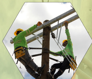
NEA-TESDA: Assessment Tool on Electric Distribution Line National Certification May 22-24

In an effort to improve the performance of ECs, NEA conducted a series of Roundtable Assessment of some 10 Under Performing, Financially and Technically Distressed Electric Cooperatives that started from June 13 until July 11, 2018.