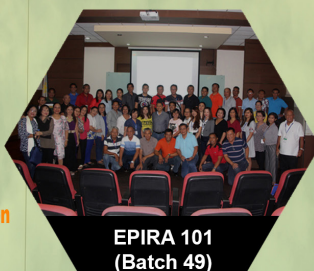
EPIRA 101 (Batch 49)