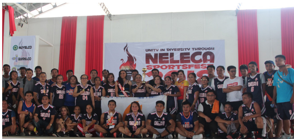
Team CAGELCO II during the awarding ceremonies as they pose with their trophy winning 2nd Place Overall