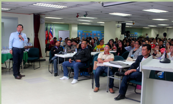
Seminar-Workshop of EC's Area Manager and Consumer Welfare Desk Officer

NEA partnered with NRECA to facilitate the Safety and Loss Control Program held at the BATELEC I headquarters in Calaca, Batangas last April 9-14, 2018. The program aims to add new skill for the EC linemen.