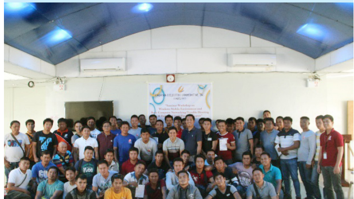
CAGELCO II MRCDs and Speakers of the Seminar-Workshop, committed to serve!

Sixty Meter Reader Collector/Disconnectors (MRCDs) have undergone a 2-day Seminar-Workshop on Enhanced Field Findings Report and Windows Mobile Environment & Trouble Shooting which was held last May 17-18, 2018 at CAGELCO II Multi-Purpose Hall, Aparri, Cagayan.