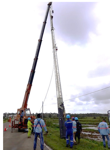
Erection of 69kV's 60 ft. steel pole at Cabaggan, Pamplona