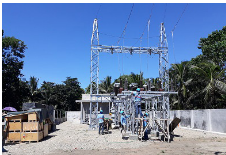
Construction of the 5/6.25 MVA Sanchez Mira Substation