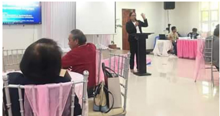
The ECs in attendance were also given opportunity to discuss before the group their work-plan on Member-Consumer-Owner Empowerment.