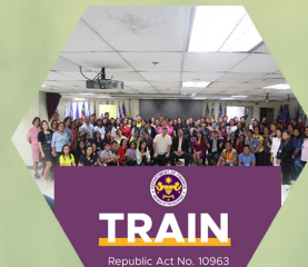
Tax Reform for Acceleration and Inclusion (TRAIN) April 11, 12, 18 and 19