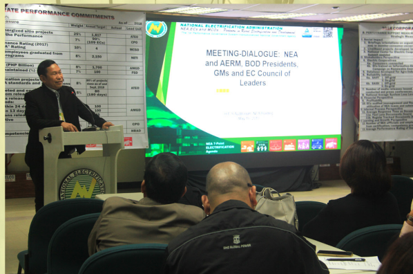
Meeting Dialogue: NEA and AERM with EC Council of Leaders, Presidents, General Managers and Allied Organization