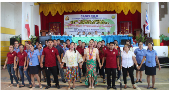
Select CAGELCO II employees rendered an intermission number dubbed as "CAGELCO II: Through the Years" showcasing the Cooperative's history through song and dance.

The AAA rating is the highest score given by the NEA to ECs that indicates the power distributors' full compliance on four parameters, namely financial, institutional, technical and reportorial requirements. The D rating is the lowest. Scores and their corresponding ratings are as follows: 95-100 = AAA; 90-94 = AA; 85-89 = A; 75-84 = B; 50-74 = C; and 49 and below = D.