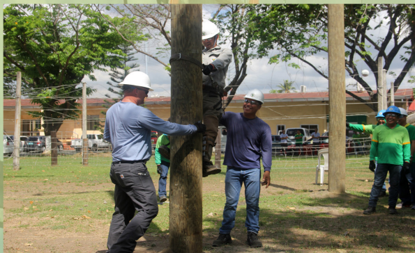
BATELEC I: Safety Training and Loss Control Program

NEA partnered with NRECA to facilitate the Safety and Loss Control Program held at the BATELEC I headquarters in Calaca, Batangas last April 9-14, 2018. The program aims to add new skill for the EC linemen.