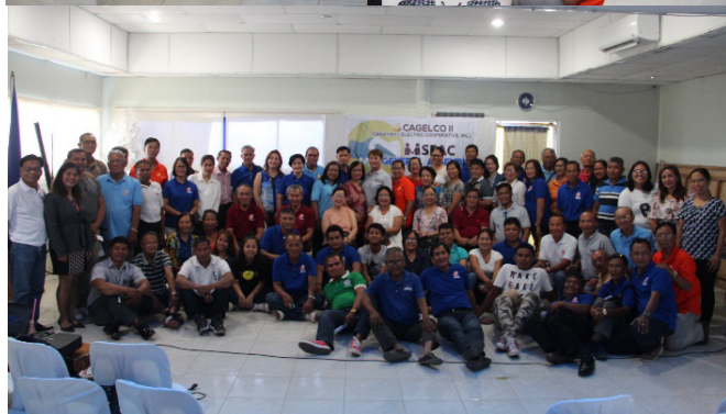
Multi-Sectoral Electrification Advisory Council (MSEAC) Members of CAGELCO II

A General Assembly meeting of the CAGELCO II Multi-Sectoral Electrification Advisory Council (MSEAC) Federation was held on May 05, 2018 at CAGELCO II Multi-Purpose Hall, Aparri, Cagayan with the aim of strengthening its networking activities.