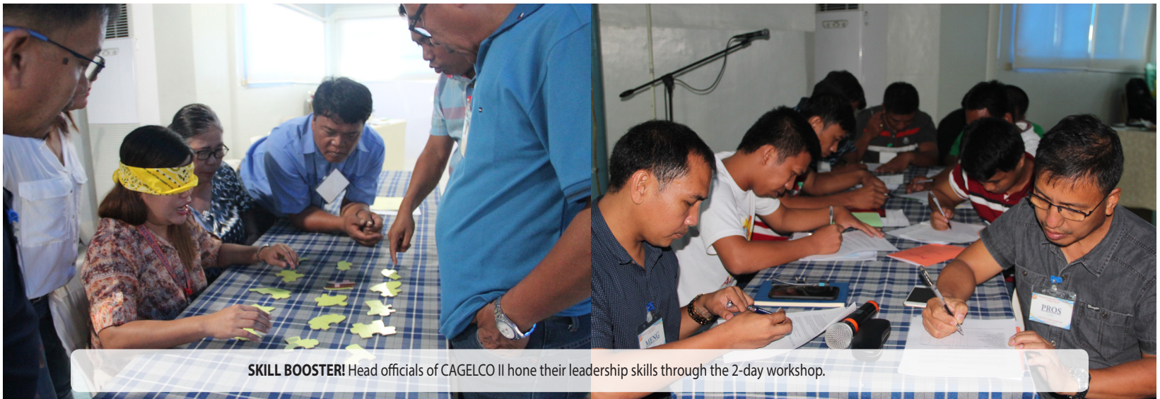
SKILL BOOSTER! Head officials of CAGELCO II hone their leadership skills through the 2-day workshop.

A total of thirty-four (34) employees underwent In-House Training on Essentials for Supervision and Leadership which aims to familiarize newly-appointed supervisors on their duties and functions and also served as a refresher for long-time supervisors of the Cooperative which was held last July 20-21, 2017 at CAGELCO II Multi-Purpose Hall.