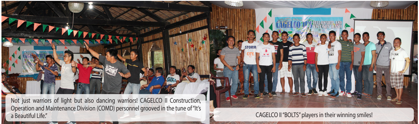
Not just warriors of light but also dancing warriors! CAGELCO II Construction, Operation and Maintenance Division (COMD) personnel grooved in the tune of "It's a Beautiful Life."