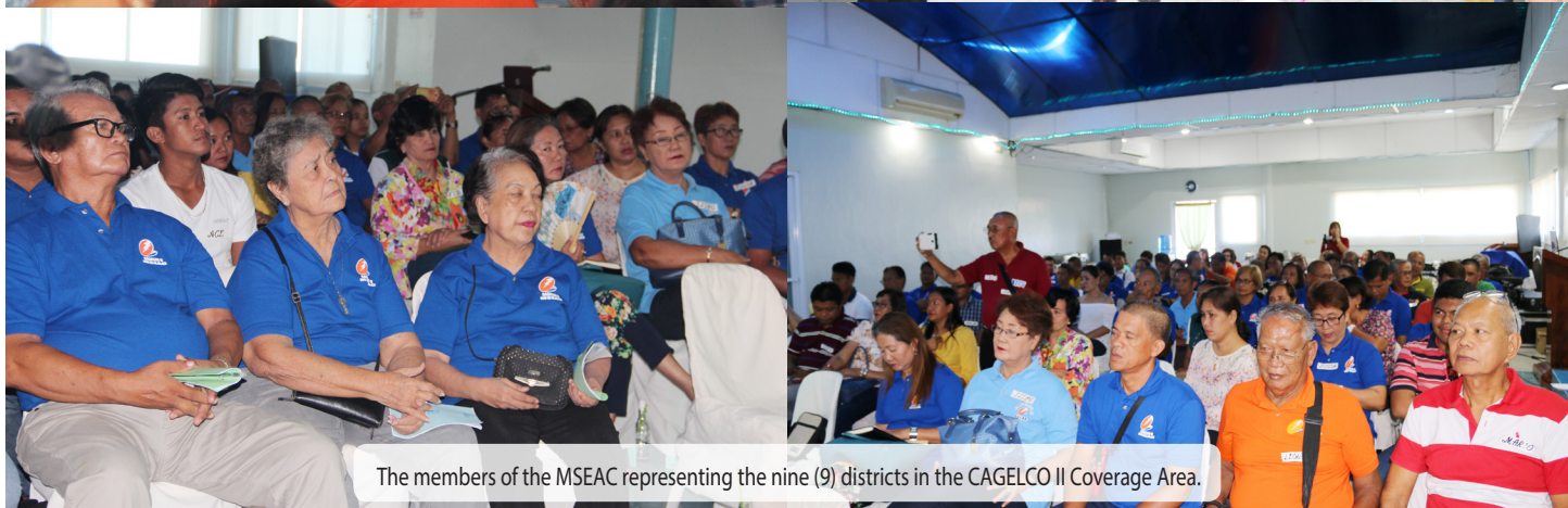
The members of the MSEAC representing the nine (9) districts in the CAGELCO II Coverage Area.