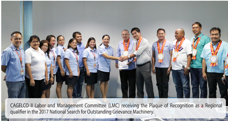
CAGELCO II Labor and Management Committee (LMC) receiving the Plaque of Recognition as a Regional qualifier in the 2017 National Search for Outstanding Grievance Machinery.

After passing the rigorous deliberation of the Regional Screening Committee of the National Conciliation and Mediation Board (NCMB) R02, CAGELCO II qualified in the 2017 National Search for Outstanding Grievance Machinery for Industrial Peace last July 27, 2017 at CAGELCO II Multi-Purpose Hall, Aparri, Cagayan.