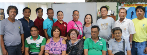
MCOO Federation Sanchez Mira Chapter