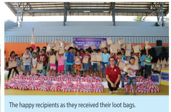
The happy recipients as they received their loot bags.