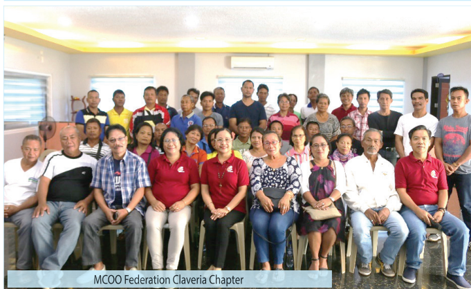
MCOO Federation Claveria Chapter