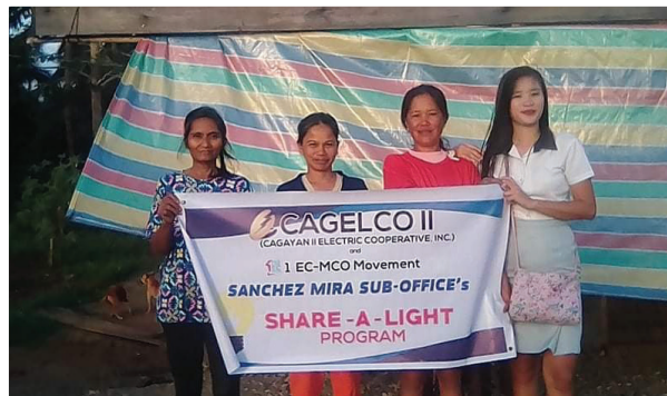
Sanchez Mira Sub-Office Share-A-Light recipients at Bagu, Pamplona.