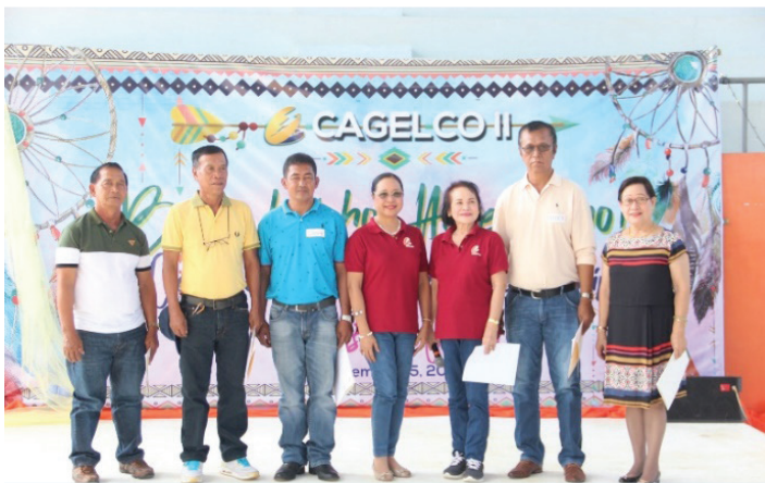
Elected officers of the Franchise-Wide Federation of Member-Consumer-Owners Organization of CAGELCO II.