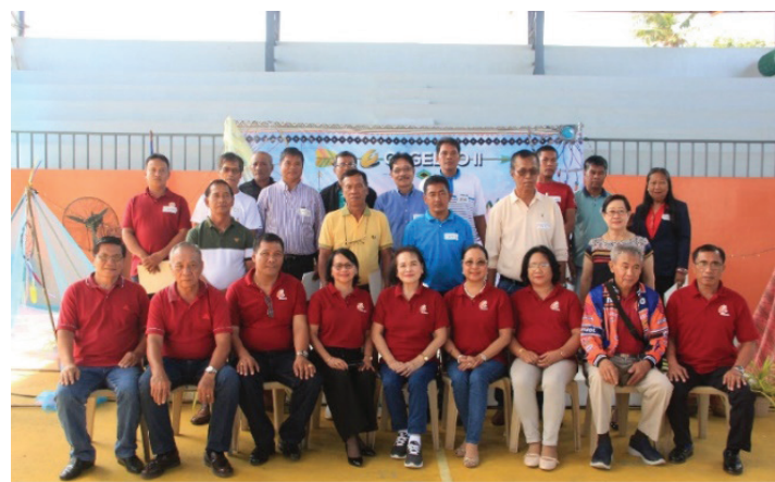
Elected officers and members of the MCOO Franchise Wide Federation together with the CAGELCO II Board of Directors and OIC, General Manager.