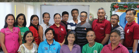
MCOO Federation Pamplona Chapter