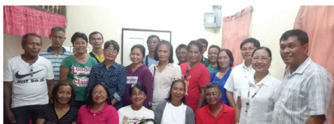
MCOO Federation Abulug Chapter