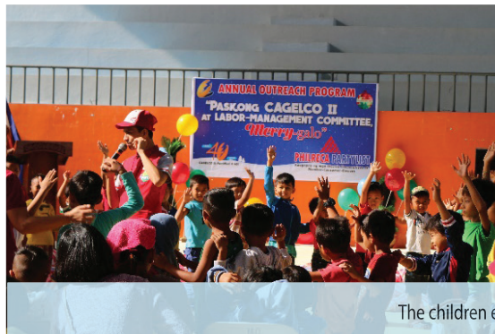
The children enjoying a game.