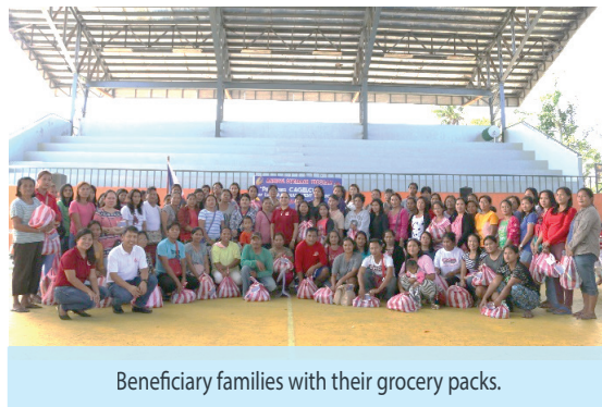
Beneficiary families with their grocery packs.